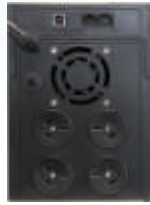
DSV 1000 - DS 2000