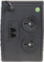
DSV 600-DS 800